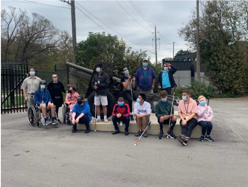
Top Photo: Students of the W. Ross Macdonald School

We promoted the museum through ZOOM Presentations for: