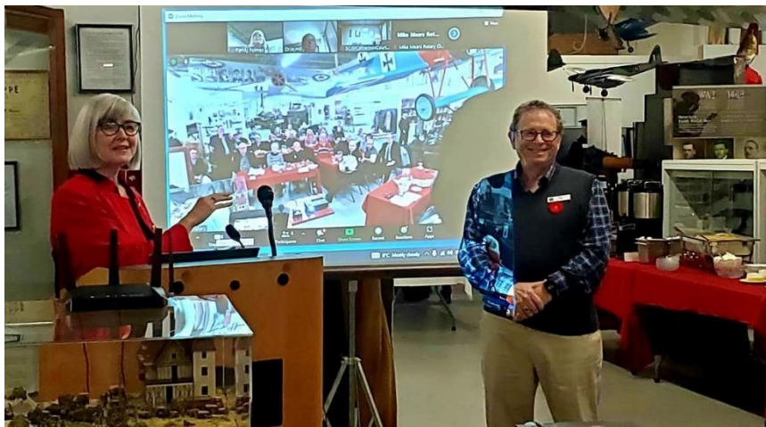
Photo: Rotary Club held their traditional Remembrance week meeting and ZOOMED for members who could attend.