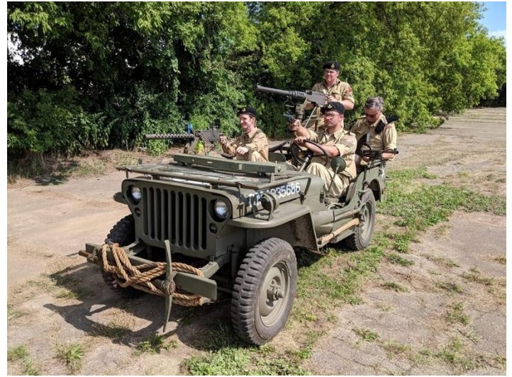
Canadian WWII re-enactors

Great food, displays and a record number of enthusiastic visitors for the annual Civic Weekend Open House !