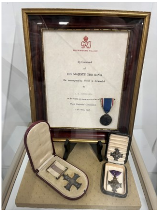
Includes Mother's Crosses, Death Pennies, Documents and photos.

This display honours the men & women from Brantford, Brant County and Six Nations who made the ultimate sacrifice during wartime.