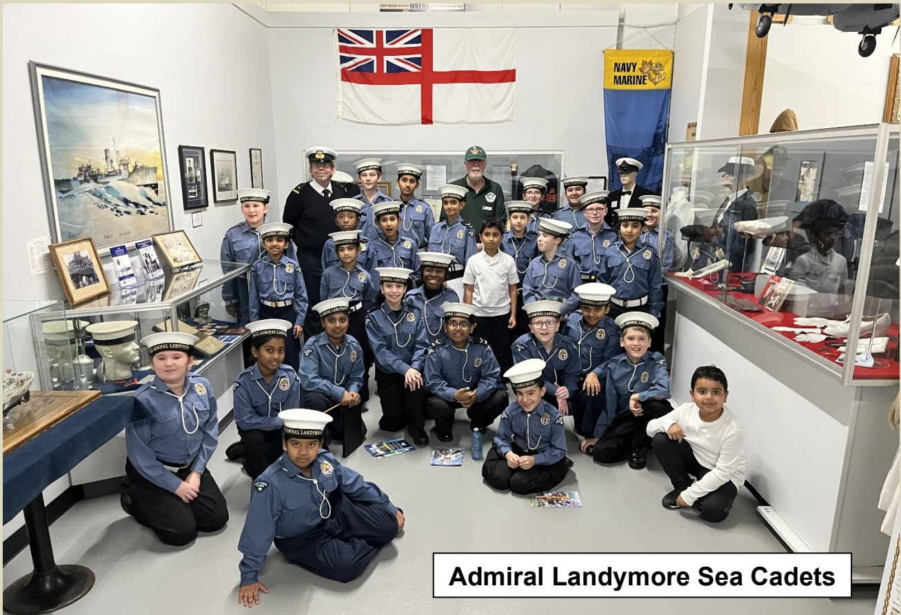
Admiral Landymore Sea Cadets

GREAT SUCCESS OPENING MONTH – 421 PEOPLE VISITED MUSEUM IN MARCH 2026